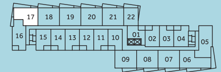
AZURE – LEVEL 6