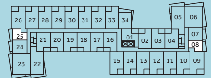
AZURE – LEVELS 2-4